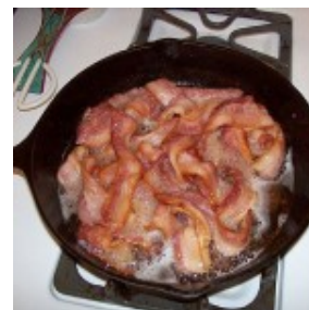
My family's favorite fat