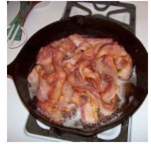
My family's favorite fat