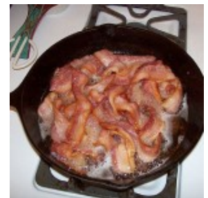
My family's favorite fat