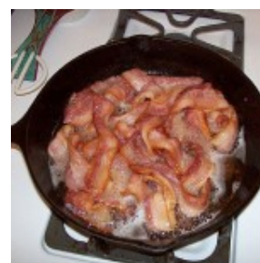
My family's favorite fat