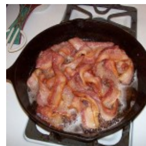
My family's favorite fat