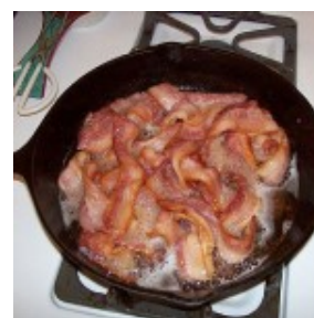
My family's favorite fat