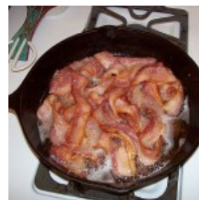
My family's favorite fat